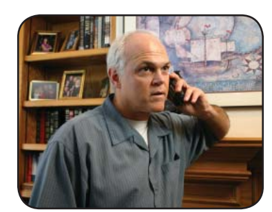
Call if sensitivity or discomfort continues