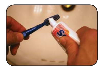
Use desensitizing toothpaste

Now that we've placed your permanent inlay or onlay, it is important to follow these recommendations to ensure its success.