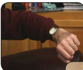
Do not chew for 30 minutes

It is not a problem for a small portion of a temporary filling to wear away or break off, but if the entire filling wears out, or if a temporary crown comes off, call us so that it can be replaced.