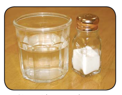
Rinse with warm salt water

To keep your temporary bridge in place, avoid eating hard or sticky foods, especially chewing gum. If possible, chew only on the opposite side of your mouth.