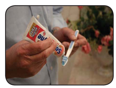
Use a desensitizing toothpaste